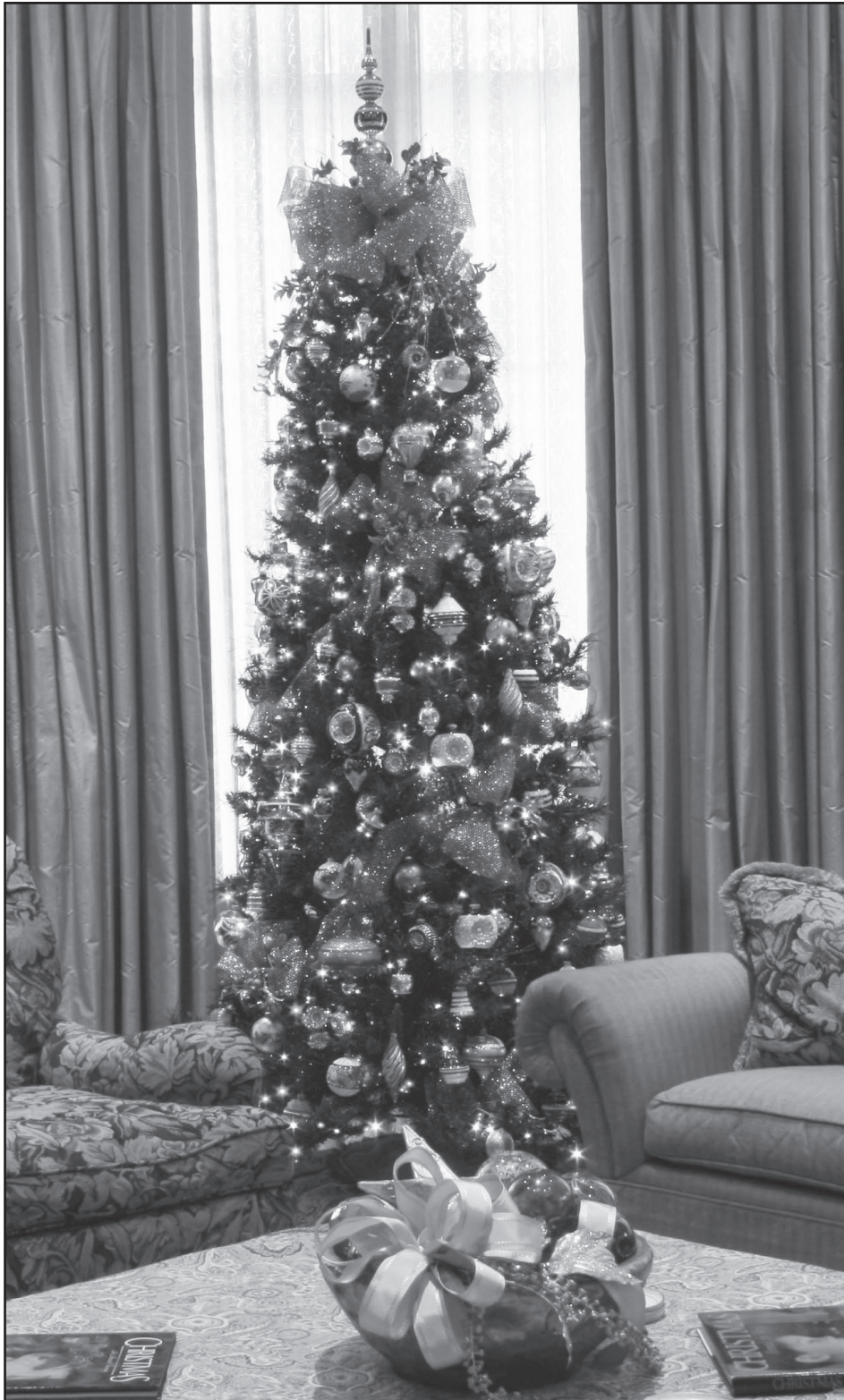
Shiny Brite tree