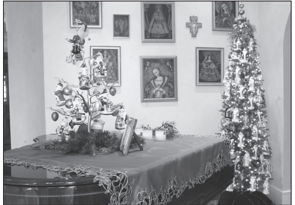
Russian Santa tree