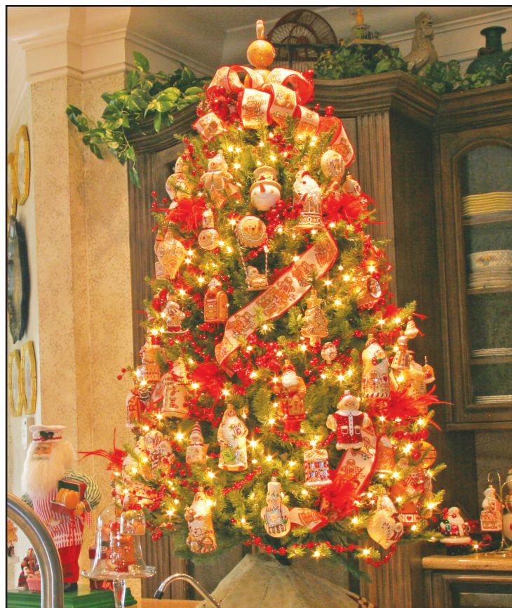
Left: Gingerbread tree