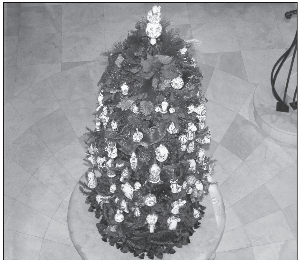
Breen Holly and Poinsettia tree